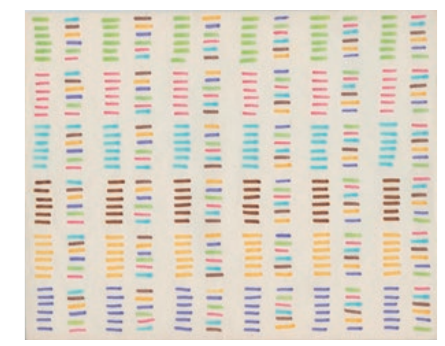
Untitled, 1970