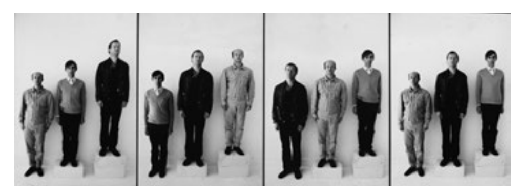
Portretten (Niveauverschillen) (Portraits (Level Differences)), 1971–1972, photo: Philippe De Gobert, courtesy of Estate of Guy Mees, Private Collection, Ghent

His work has been featured in various international group exhibitions including: Zero Avantgarde, Lucio Fontana's Atelier, Milan (1965); Wide White Space, Antwerp (1967): Belgium Avant-Garde, Palais des Beaux-Arts, Brussels (1973); Museum of Modern Art. Oxford. (1974): The Sixties: Art in Belgium, Stedelijk Museum voor Actuele Kunst (SMAK), Ghent (1979); Betekende Ruimte II-Plaats van Handeling / Designated Space II–Space as Scene. Museum Dhondt-Dhaenens, Deurle, (1993); La Consolation, Magasin Centre National d'Art Contemporain de Grenoble (1999): Exile on Main Street, N.I.C.C, Antwerp (2002): STUK. Leuven. (2002): Dedicated to a proposition, Extra-City Kunsthal, Antwerp (2004); Monopolis - Antwerpen, Witte de With, Center for Contemporary Art, Rotterdam (2005); A Story of the Image: Old & New Masters from Antwerp, Museum van Hedendaagse Kunst Antwerpen, Antwerp (travelled to Shanghai Art Museum, followed by National Museum of Singapore, 2007-2009): 7. Roger Raveel Museum, Machelen-Zulte (2007); T-Tris B.P.S.22, Espace de création Contemporaine, Charleroi (2009); The Responsive Subject, Mu.ZEE, Ostend (2010-2011); Looking Back, Argos, Brussels (2012): 50 Days at Sea, 9th Shanghai Biennale (2012): The Gap: Selected Abstract Art from Belgium at the Parasol unit foundation for contemporary art, London and the Museum van Hedendaagse Kunst Antwerpen, Antwerp (2015-2016) among others.