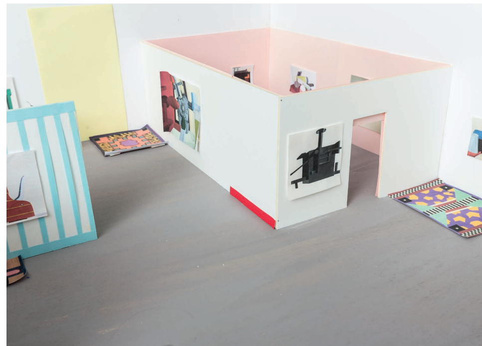
Model for the exhibition.