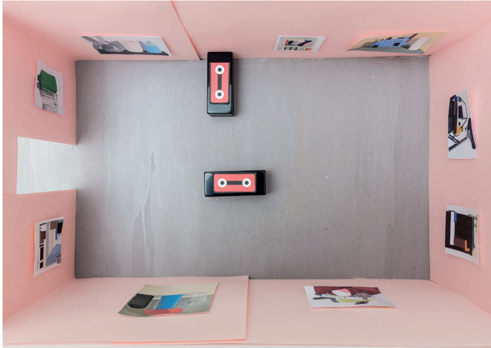
Model for the exhibition.

For this exhibition I wanted to show work produced in the last 35 years.