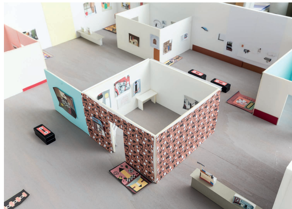
Model for the exhibition.