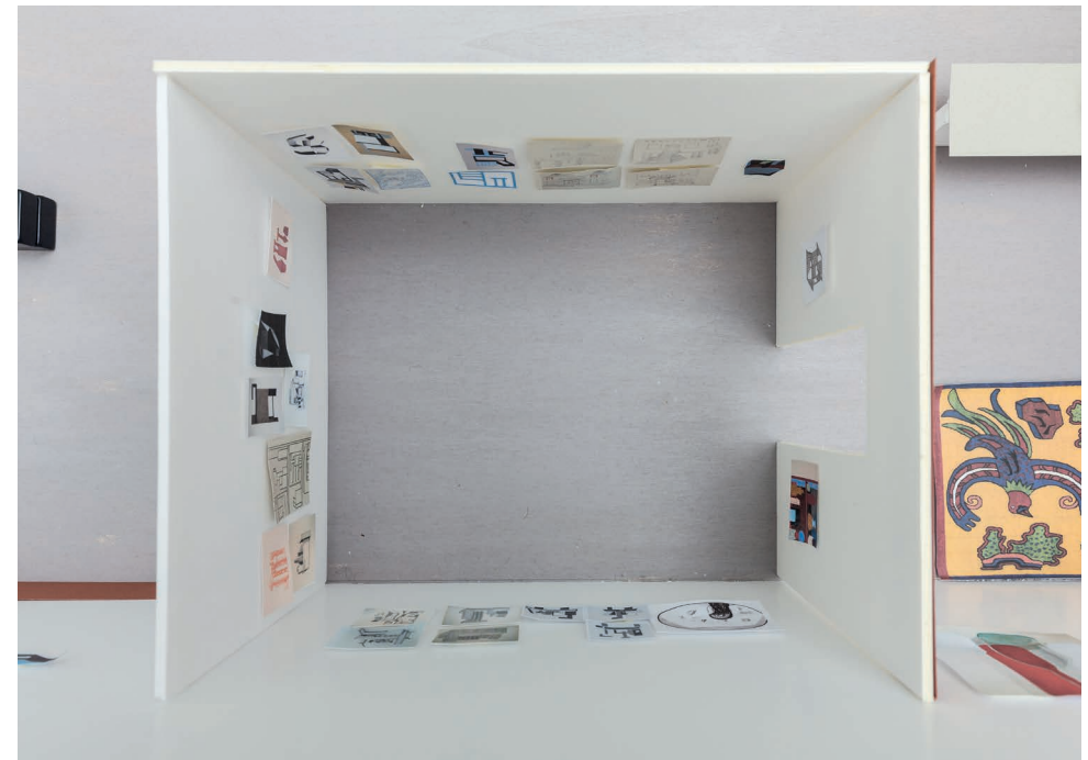
Model for the exhibition.

Continuing through there is a space between the house of drawings and the other small house that we shall enter later. In this space I wanted to exhibit floating works, works “in-between”. I have always enjoyed entering the studio in the morning and being surprised by a work I had done the day before as if it was the first time I was seeing it. A strange feeling of “straniamento”. With this group of works that combine 3D pieces with a kind of trompe-l’oeil painted on paper and cut out, I have that same strange feeling every time, my eye cannot be sure what is the 3D piece and what is flat on the wall. Every time seems like the first time.