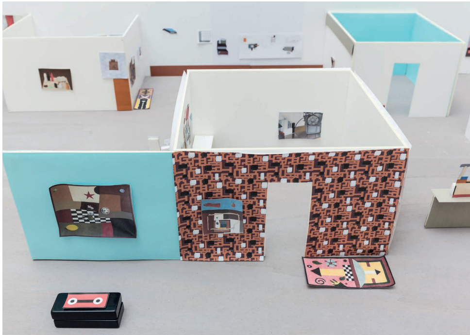
Model for the exhibition.