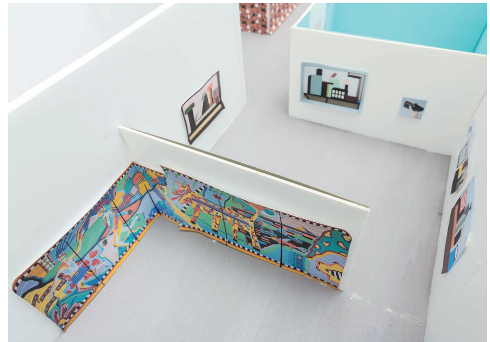
Model for the exhibition.