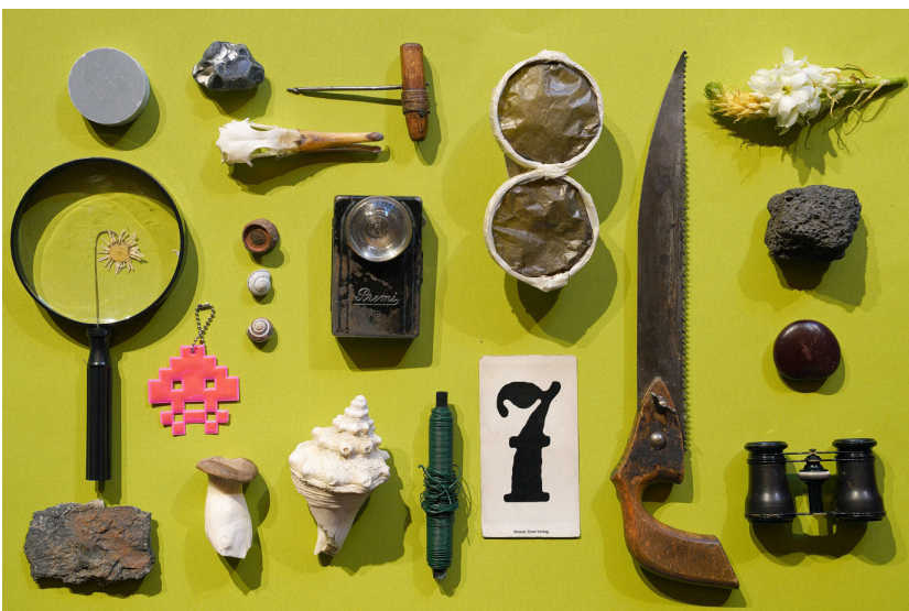
Space for Kids. The Art-Nature Laboratory or The Mushrooming Cabinet of Wonders

children and all others who are interested work with artists and art educators to create an exhibition. Various workshops let the participants try out a range of creative methods and practices and playfully discover new ways of seeing the world around us. The results of the workshops as well as other visitors' contributions and traces are presented in the form of a continually growing and mushrooming exhibition. ●