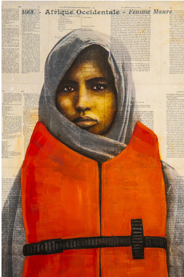
Rajkamal Kahlon, Untitled (Life Jacket) , from the series We've Come a Long Way to Be Together , 2019, mixed media painting on canvas

Rajkamal Kahlon's solo exhibition at kunsthalle wien will give an overview of over twenty years of her artistic practice, and present new projects that continue her research of the representational violence of European colonial endeavors and Western knowledge production. ●